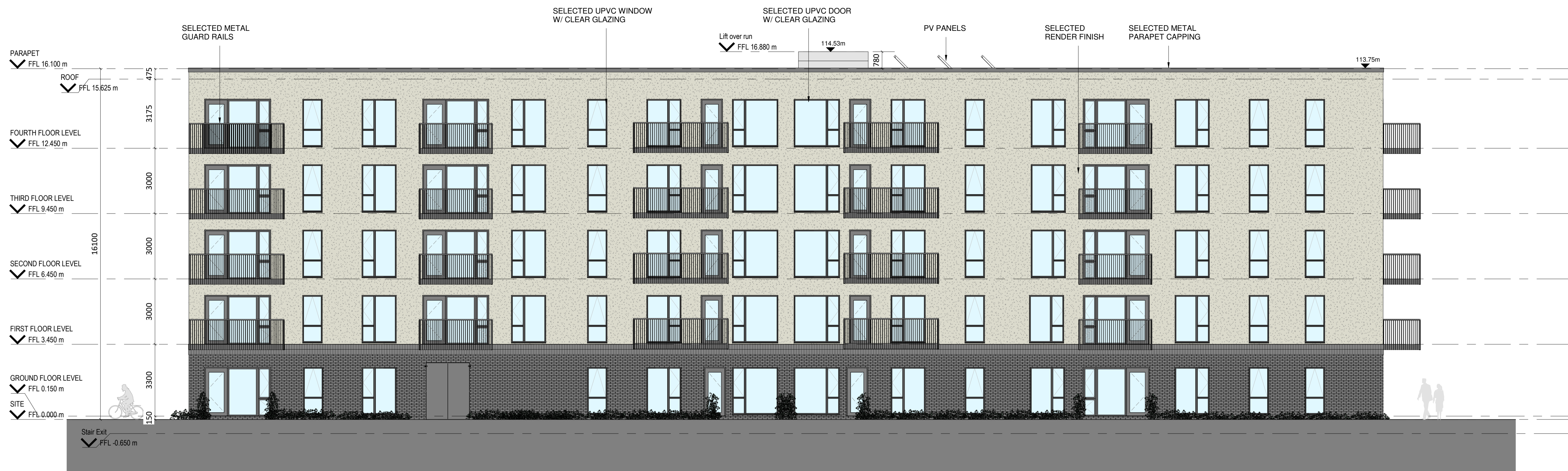
1 BLOCK A - WEST ELEVATION 1 : 100