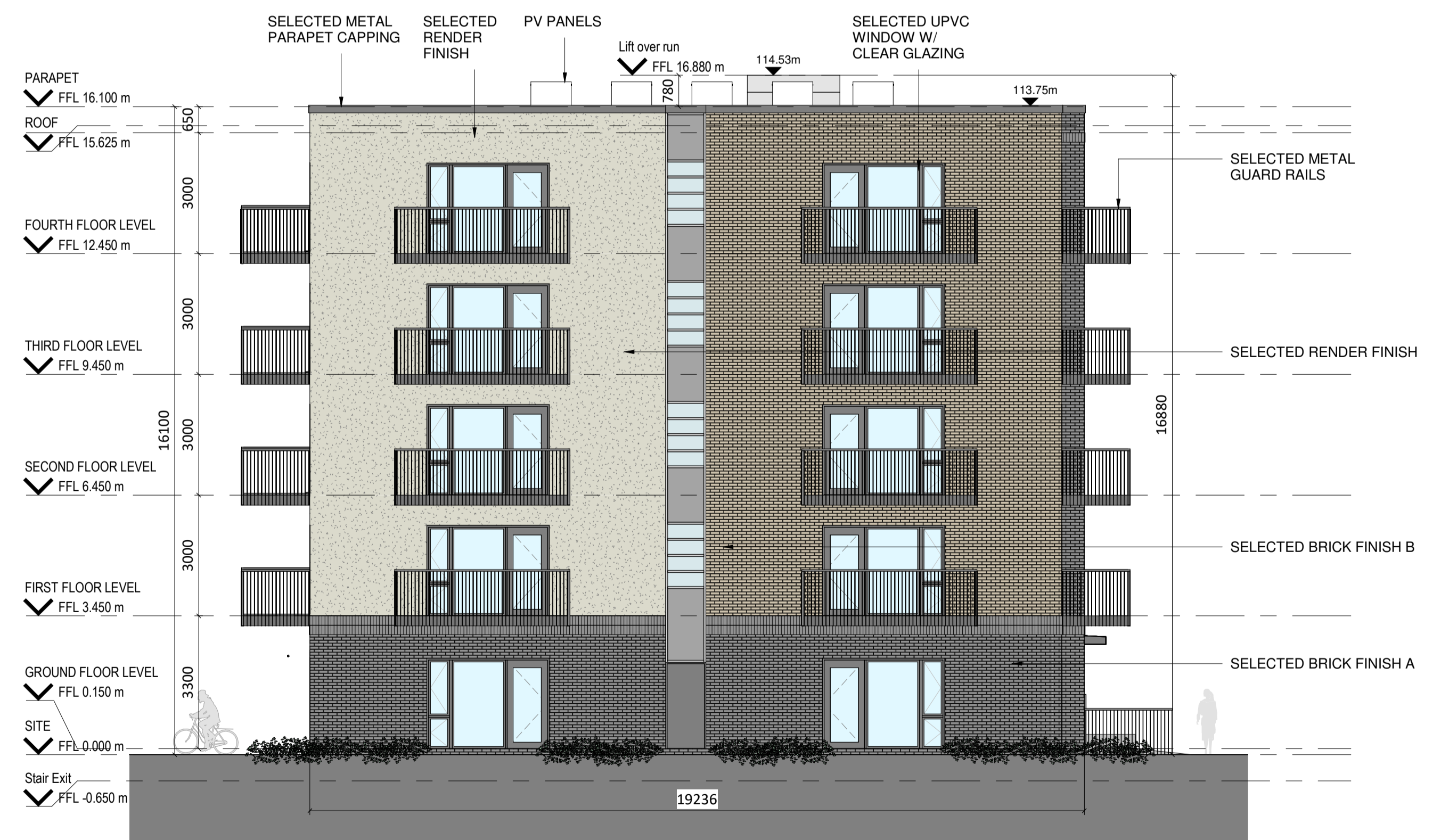
3 BLOCK A - SOUTH ELEVATION 1 : 100