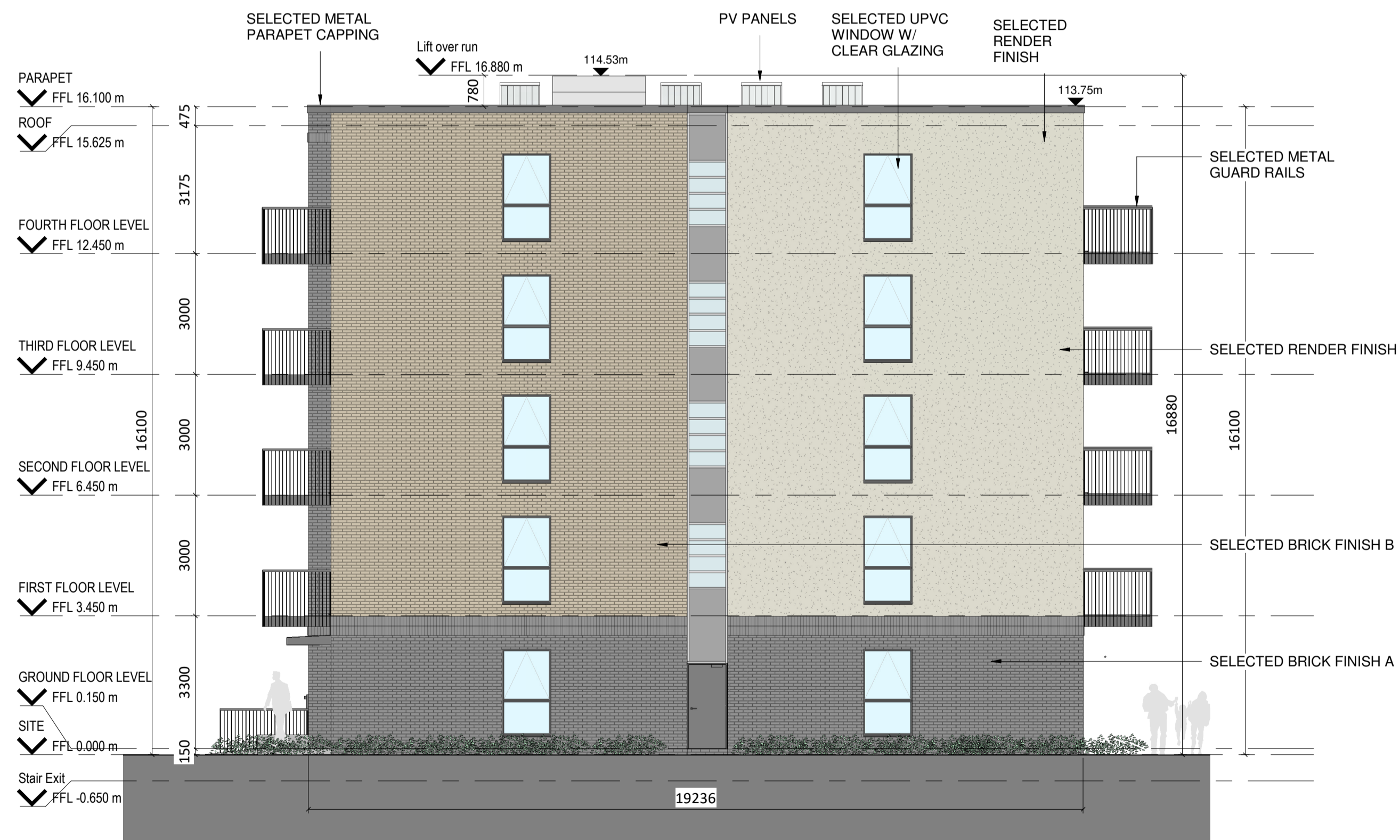
2 BLOCK A - NORTH ELEVATION 1 : 100